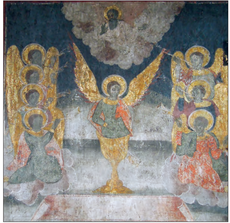
Fig. 2 - Capitolul 8 al Apocalipsei – Biserica Icoanei, București/Chapter 8 of the book of Revelation – Icoanei church

interesting to notice how the Apocalyptic vision from Dionysiou changed in time through the interpretation of the painter Grigorie of Icoanei church. Despite of the rigorousness of its Byzantine style, the composition from Dionysiou still kept something of the dynamism and baroque boisterousness of the German engravings. But, if at Dionysiou the heavenly register overwhelms the earth action 34 and the symbolic, personified fantastic elements magnify the supernatural atmosphere, the porch painter of Icoanei's church is guided by entirely different other criteria and feelings.