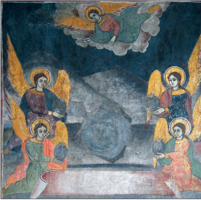
Fig 1 – Capitolul 7 al Apocalipsei – Biserica Icoanei, București – fotografie realizată de Gabriela Ștefăniță /Chapter 7 of the book of Revelation – Icoanei church (photo: Gabriela Ștefăniță)