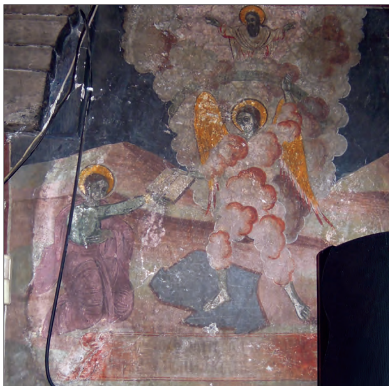
Fig. 4 - Capitolul 10 al Apocalipsei – Biserica Icoanei, București – fotografie realizată de Gabriela Ștefăniță/Chapter 10 of the book of Revelation – Icoanei church (photo: Gabriela Ștefăniță)

the eastern wall. Due to the architectural changes that came in time, only five scenes are preserved.