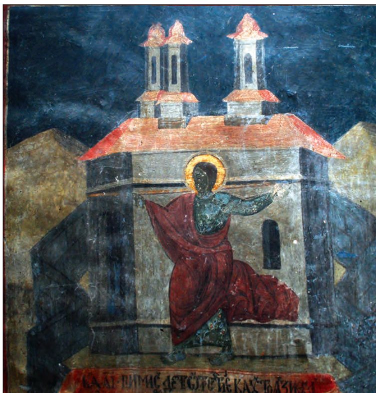
Fig. 5 - Capitolul 11 al Apocalipsei – Biserica Icoanei, București/Chapter 11 of the book of Revelation – Icoanei church

representation of this scene. In all cases, the church painters would use then, as today, "The Hermeneia of the Byzantine Painting", one of the most widely used version being the one of Dionysius of Fournas, in which there are recorded all the necessary directions for the iconographic representations. In this manual it is mentioned the following: "The temple and in it, the altar and Saint John (the Theologian) measuring with a rod...", yet the temple representation from this scene is a construction similar to the one votive picture from narthex, in which the church founder keeps in hand the image of Icoanei church, in the way it looked at the beginning of the 18 th century.